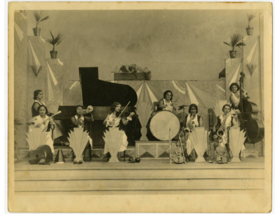
Orquesta femenina Cubana (Cuban women's orchestra), 1930-1939, photograph, 20.2 x 25.2 cm.